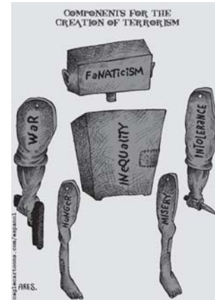
Components for the Creation of Terrorism

However, we have noted that violence does not originate merely within the individual psyche; it is also rooted in certain social structures. The elimination of structural violence necessitates the creation of a just and democratic society. Peace, understood as the harmonious coexistence of contented people, would be a product of such a society. It can never be achieved once and for all. Peace is not an end-state, but a process involving an active pursuit of the moral and material resources needed to establish human welfare in the broadest sense of the term.