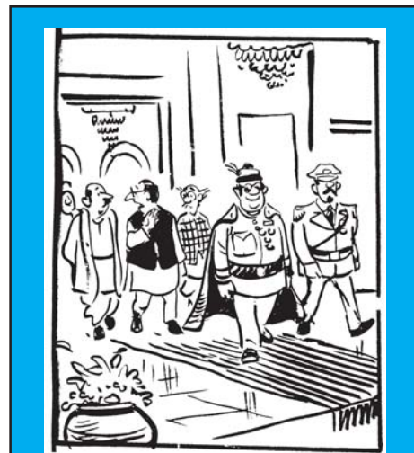
R. K. Laxman in the Times of India

Peace is often defined as the absence of war. The definition is simple but misleading. This is because war is usually equated with armed conflict between countries. However, what happened in Rwanda or Bosnia was not a war of this kind. Yet, it represented a