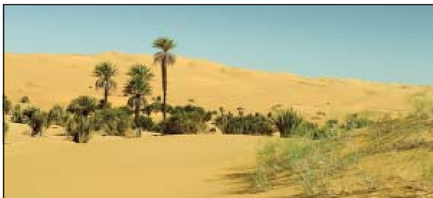
Fig. 10.3: Oasis in the Sahara Desert

snakes and lizards are the prominent animal species living there.