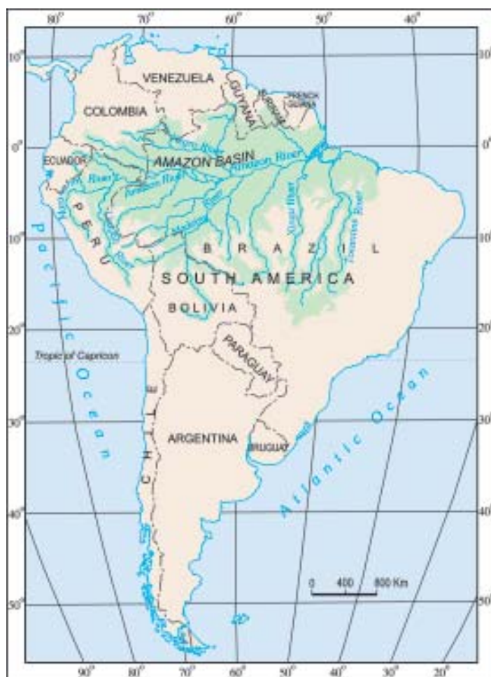
Fig. 8.2: Amazon Basin in South America

Name the countries of the basin through which the equator passes.