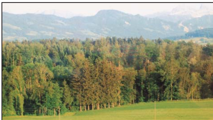
Fig. 6.7: Temperate Evergreen Forest

The temperate evergreen forests are located in the mid-latitudinal coastal region (Fig. 6.7). They are commonly found along the eastern margin of the continents, e.g., In south east USA, South China and in South East Brazil. They comprise both hard and soft wood trees like oak, pine, eucalyptus, etc.