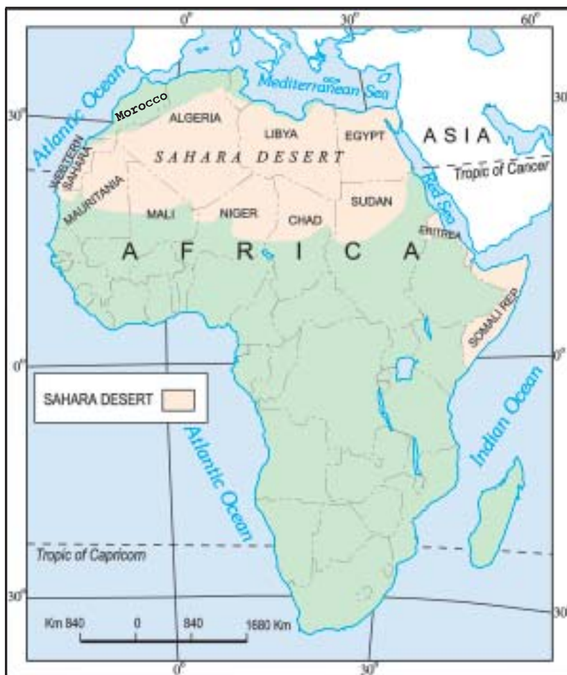
Fig. 10.2: Sahara in Africa

You will be surprised to know that present day Sahara once used to be a lush green plain. Cave paintings in Sahara desert show that there used to be rivers with crocodiles. Elephants, lions, giraffes, ostriches, sheep, cattle and goats were common animals. But the climate has changed it to a very hot and dry region.