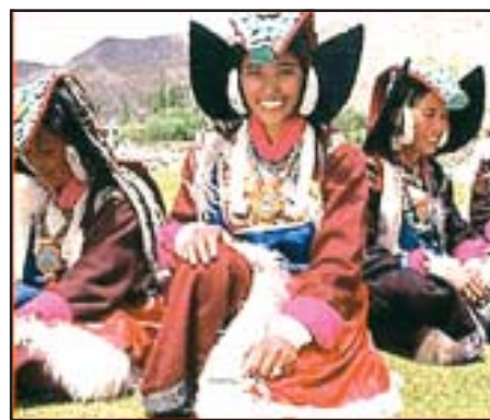
Fig. 10.6. Ladakhi Women in Traditional Dress

Life of people is undergoing change due to modernisation. But the people of Ladakh have over the centuries learned to live in balance and harmony with nature. Due to scarcity of resources like water and fuel, they are used with reverence and care. Nothing is discarded or wasted.