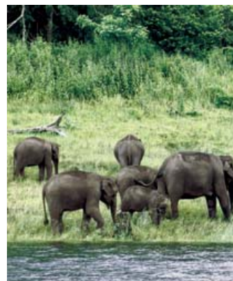
Fig. 6.8: Elephants