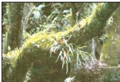
Fig. 8.3 Amazon Forest

As it rains heavily in this region, thick forests grow (Fig. 8.3). The forests are in fact so thick that the dense “roof” created by leaves and branches does not allow the sunlight to reach the ground. The ground remains dark and damp. Only shade tolerant vegetation may grow here. Orchids, bromeliads grow as plant parasites.