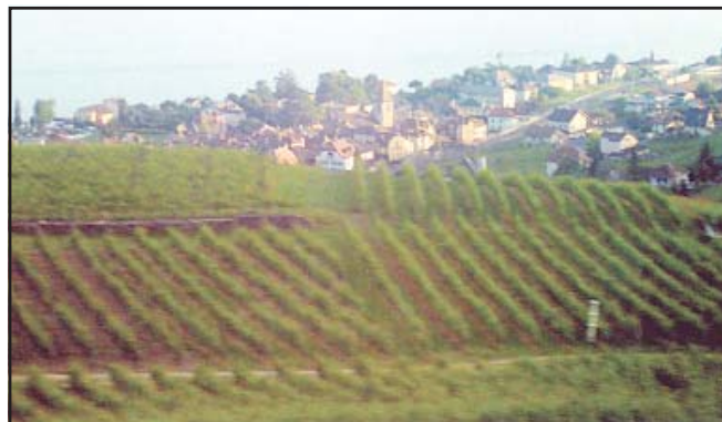
Fig. 6.12: A vineyard in the Mediterranean Region

You have learnt that most of the east and north east margins of the continents are covered by temperate evergreen and deciduous trees. The west and south west margins of the continents are different. They have Mediterranean vegetation (Fig. 6.12). It is mostly found in the areas around the Mediterranean sea in Europe, Africa and Asia, hence the name. This kind of vegetation is also found outside the actual Mediterranean region in California in the USA, south west Africa, south western