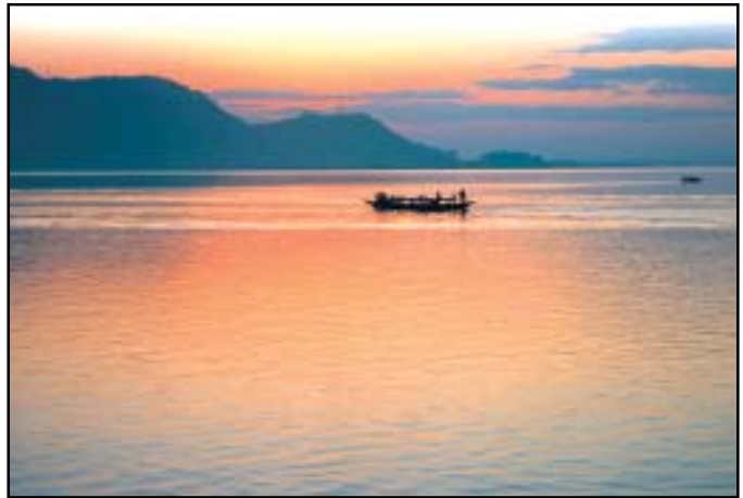
Fig. 8.7 Brahmaputra river

The plains of the Ganga and the Brahmaputra, the mountains and the foothills of the