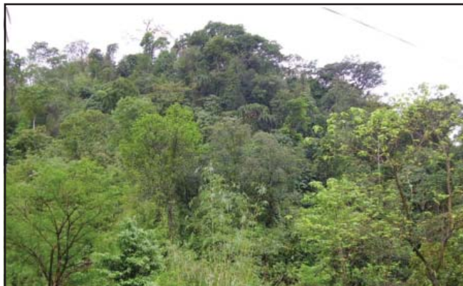
Fig. 6.3: Tropical Evergreen Forests

These forests are also called tropical rainforests (Fig. 6.3). These thick forests occur in the regions near the equator and close to the tropics. These regions are hot and receive heavy rainfall throughout the year. As there is no particular dry season, the trees do not shed their leaves altogether. This is the reason they are called evergreen. The thick canopies of the closely spaced trees do not allow the sunlight to penetrate inside the forest even in the day time. Hardwood trees like rosewood, ebony, mahogany are common here.