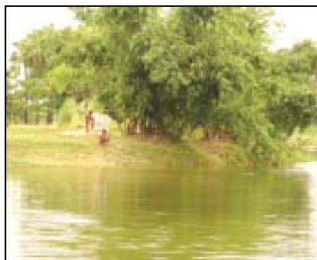
A clean lake

Binod is a fisherman living in the Matwali Maun village of Bihar. He is a happy man today. With the efforts of the fellow fishermen – Ravindar, Kishore, Rajiv and others, he cleaned the maun or the ox-bow lake to cultivate different varieties of fish. The local weed (vallisneria, hydrilla) that grows in the lake is the food of the fish. The land around the lake is fertile. He sows crops such as paddy, maize and pulses in these fields. The buffalo is used to plough the land. The community is satisfied. There is enough fish catch from the river – enough fish to eat and enough fish