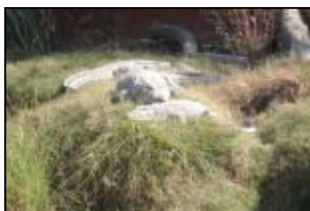
Fig. 8.12 Crocodiles