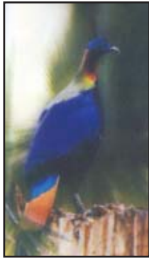
Fig. 6.10: Monal