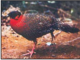
Fig. 6.9: Pheasant