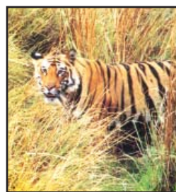
Fig. 6.5: Tiger