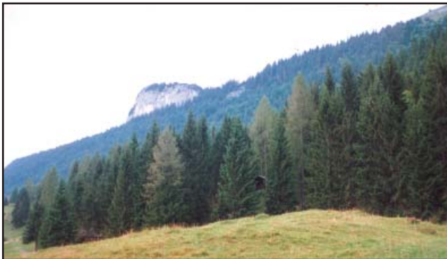
Fig. 6.13 (a): Coniferous Forest

Taiga means pure or untouched in the Russian language