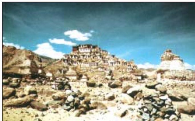
Fig. 10.5 Thiksey Monastery

The finest cricket bats are made from the wood of the willow trees.