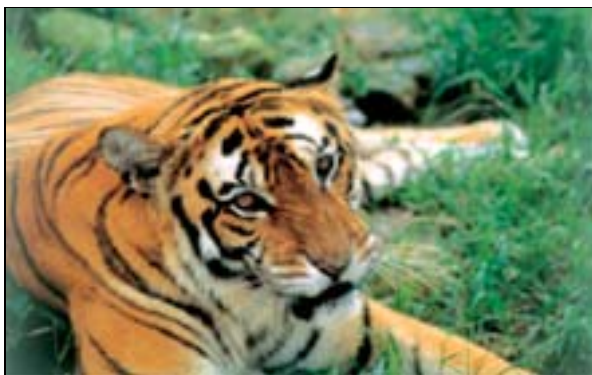
Fig. 8.14: Tiger in Manas Wildlife sanctuary

All the four ways of transport are well developed in the Ganga-Brahmaputra basin. In the plain areas the roadways and railways transport the people from one place to another. The waterways, is an effective means of transport particularly along the rivers. Kolkata is an important port on the River Hooghly. The plain area also has a large number of airports.