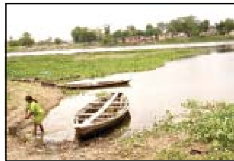
A Polluted Lake

to sell in the market. They have even begun supply to the neighbouring town. The community is living in harmony with nature. As long as the pollutants from nearby towns do not find their way into the lake waters, the fish cultivation will not face any threat.