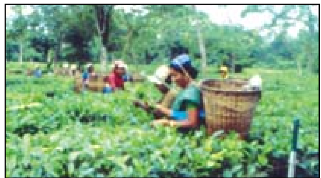
Fig. 8.10 Tea Garden in Assam