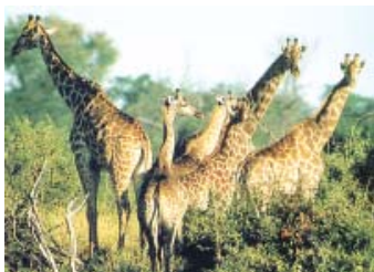
Fig. 6.15: Giraffes