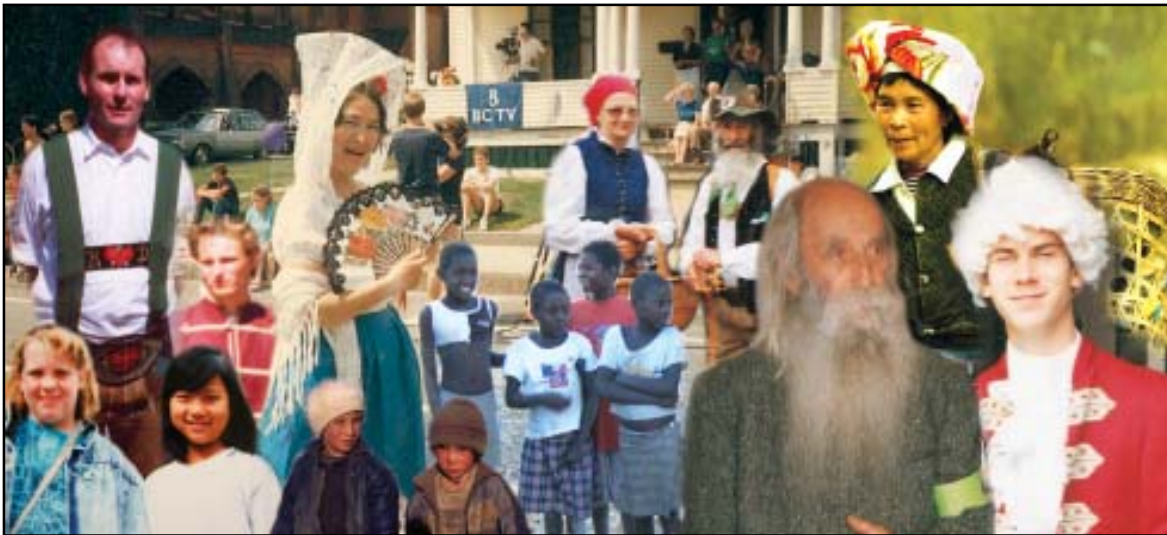
Fig. 8.1: People from various parts of the world