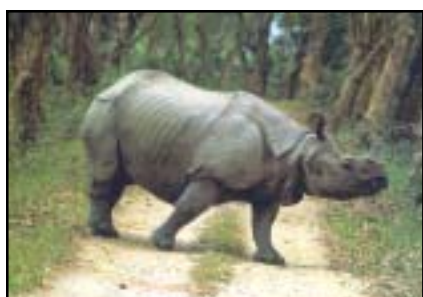
Fig. 8.11 One horned rhinoceros

There is a variety of wildlife in the basin. Elephants, tigers, deer and monkeys are common. The one-horned rhinoceros is found in the Brahmaputra plain. In the delta area, Bengal tiger, crocodiles and alligator are found. Aquatic life abounds in the fresh river waters, the lakes and the Bay of Bengal Sea. The most popular varieties of the fish are the rohu, catla and hilsa. Fish and rice is the staple diet of the people living in the area.