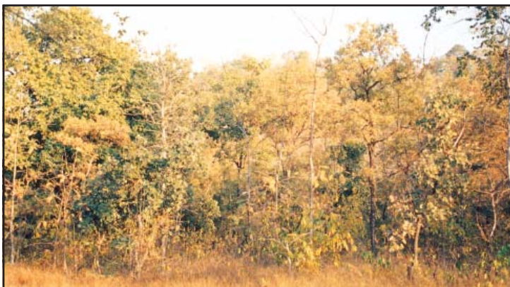
Fig. 6.4: Tropical Deciduous Forests

Tropical deciduous are the monsoon forests found in the large part of India, northern Australia and in central America (Fig. 6.4). These regions experience seasonal changes. Trees shed their leaves in the dry season to conserve water. The hardwood trees found in these forests are sal, teak, neem and shisham. Hardwood trees are extremely useful for making furniture, transport and constructional materials. Tigers, lions, elephants, langoors and monkeys are the common animals of these regions (Fig. 6.5, 6.6 and 6.8).