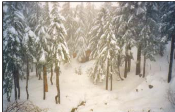
Fig. 6.13 (b): Snow covered Coniferous Forest