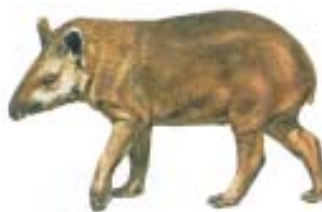
Fig. 8.5 Tapir

The rainforest is rich in fauna. Birds such as toucans (Fig. 8.4), humming birds, bird of paradise with their brilliantly coloured plumage, oversized bills for eating make them different from birds we commonly see in India. These birds also make loud sounds in the forests. Animals like monkeys, sloth and ant-eating tapirs are found here (Fig. 8.5). Various species of reptiles and snakes also thrive in these jungles. Crocodiles, snakes, pythons abound. Anaconda and boa constrictor are some of the species. Besides, the basin is home to thousands of species of insects. Several species of fishes including the flesh-eating Piranha fish is also found in the river. This basin is thus extraordinarily rich in the variety of life found there.