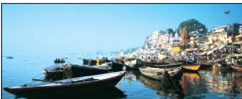
Fig. 8.13: Varanasi along the River Ganga

The Ganga-Brahmaputra plain has several big towns and cities. The cities of Allahabad, Kanpur, Varanasi, Lucknow, Patna and Kolkata all with the population of more than ten lakhs are located along the River Ganga (Fig. 8.13). The wastewater from these towns