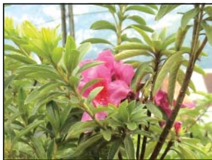
Fig. 6.1: Rhododendron

Salima was excited about the summer camp she was attending. She had gone to visit Manali in Himachal Pradesh along with her class mates. She recalled how surprised she was to see the changes in the landform and natural vegetation as the bus climbed higher and higher. The deep jungles of the foothills comprising sal and teak slowly disappeared. She could see tall trees with thin pointed leaves and cone shaped canopies on the mountain slopes. She learnt that those were coniferous trees. She noticed blooms of bright flowers on tall trees. These were the rhododendrons. From Manali as she was travelling up to Rohtang pass she saw that the land was covered with short grass and snow in some places.