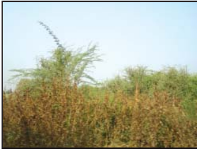
Fig. 6.2: Thorny shrubs