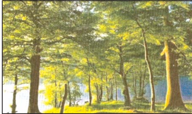
Fig. 6.11: Temperate Deciduous Forest

As we go towards higher latitudes, there are more temperate deciduous forests (Fig. 6.11). These are found in the north eastern part of USA, China, New Zealand, Chile and also found in the coastal regions of Western Europe. They shed their leaves in the dry season. The common trees are oak, ash, beech, etc. Deer, foxes, wolves are the animals commonly found. Birds like pheasants, monals are also found here (Fig. 6.9 and 6.10).