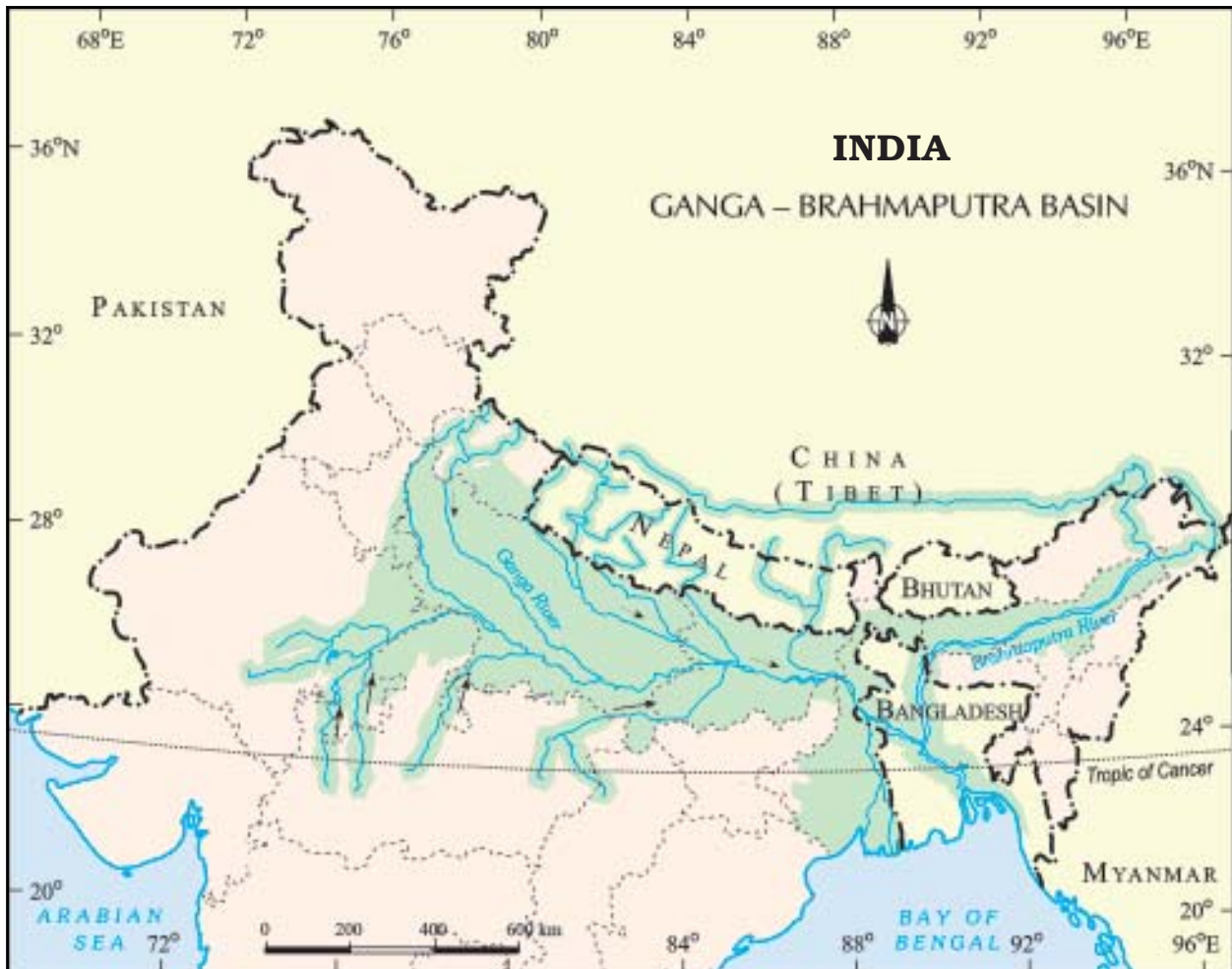
Fig. 8.8: Ganga-Brahmaputra Basin