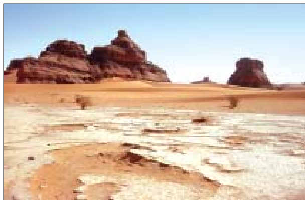
Fig. 10.1: The Sahara Desert

When you think of a desert the picture that immediately comes to your mind is that of sand. But besides the vast stretches of sands, that Sahara desert is covered with, there are also gravel plains and elevated plateaus with bare rocky surface. These rocky surfaces may be more than 2500m high at some places.