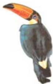
Fig. 8.4 Toucans

The rainforest is rich in fauna. Birds such as toucans (Fig. 8.4), humming birds, bird of paradise with their brilliantly coloured plumage, oversized bills for eating make them different from birds we commonly see in India. These birds also make loud sounds in the forests. Animals like monkeys, sloth and ant-eating tapirs are found here (Fig. 8.5). Various species of reptiles and snakes also thrive in these jungles. Crocodiles, snakes, pythons abound. Anaconda and boa constrictor are some of the species. Besides, the basin is home to thousands of species of insects. Several species of fishes including the flesh-eating Piranha fish is also found in the river. This basin is thus extraordinarily rich in the variety of life found there.