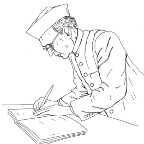
Jawaharlal Nehru CAD, Vol. VI, p. 734

“We did not give him any real power but we have made his position one of authority and dignity. The constitution wants to create neither a real executive nor a mere figurehead, but a head that neither reigns nor governs; it wants to create a great figurehead...”