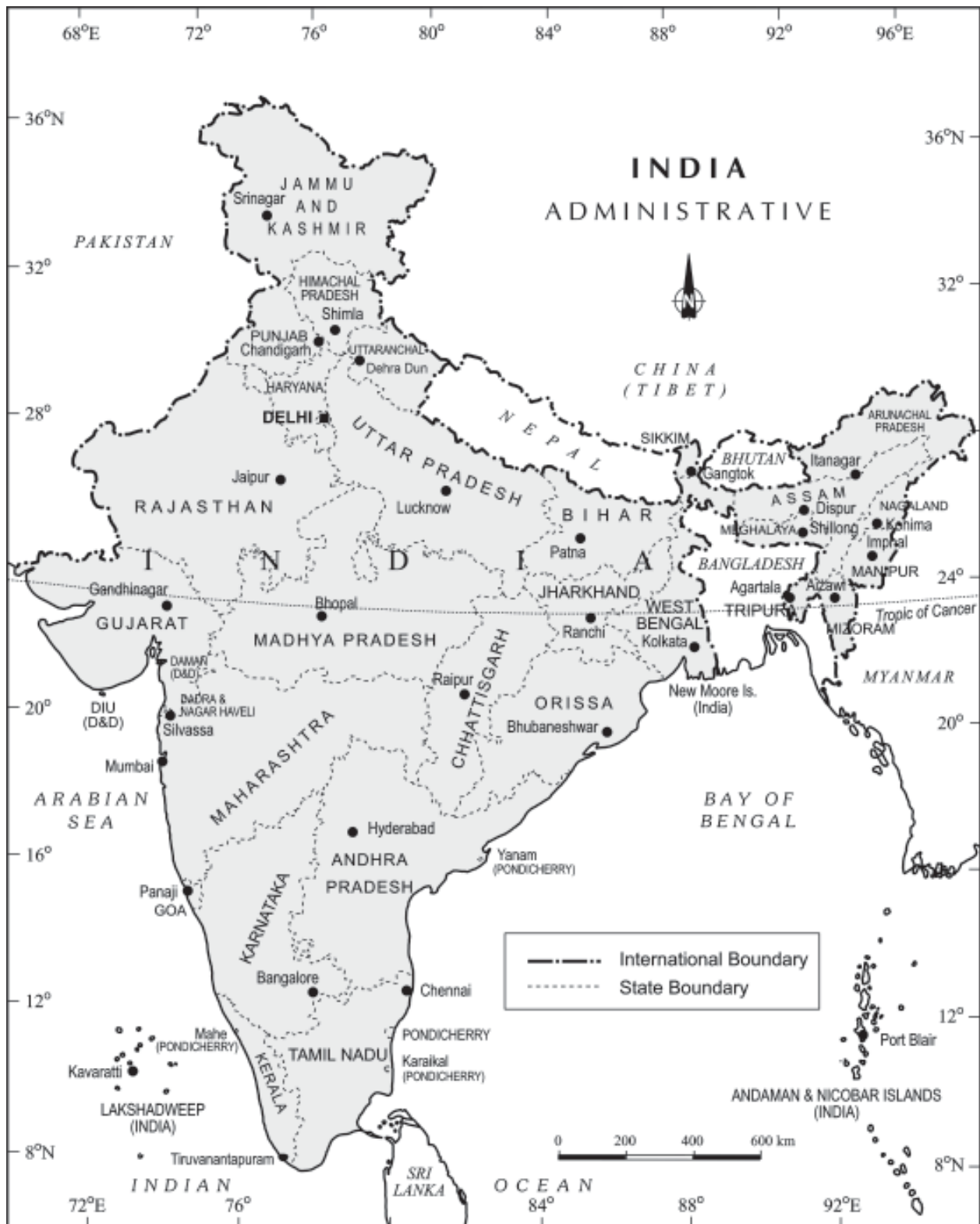
Figure 1.1 : India : Administrative Divisions