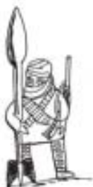
Errorists Loose cannonballs

Toppleton defends freedom and democracy. That's why he is so generous with guns and missiles. Like the ones he gave us to fight the invading Ruffians. He even trained us. We did not realise that it was the oil they were after. Bigoil is always trying to woo us. But we are too busy playing war games. Now we have rules of our own.