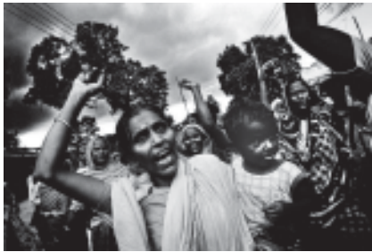
An entire community erupted in protests against a proposed open-cast coal mine project in Phulbari town, in the North-West district of Dinajpur, Bangladesh. Here several dozen women, one with her infant child, are chanting slogans against the proposed coal mine project in 2006.

are now being re-opened to MNCs through the liberalisation of the global economy. The mineral industry's extraction of earth, its use of chemicals, its pollution of waterways and land, its clearance