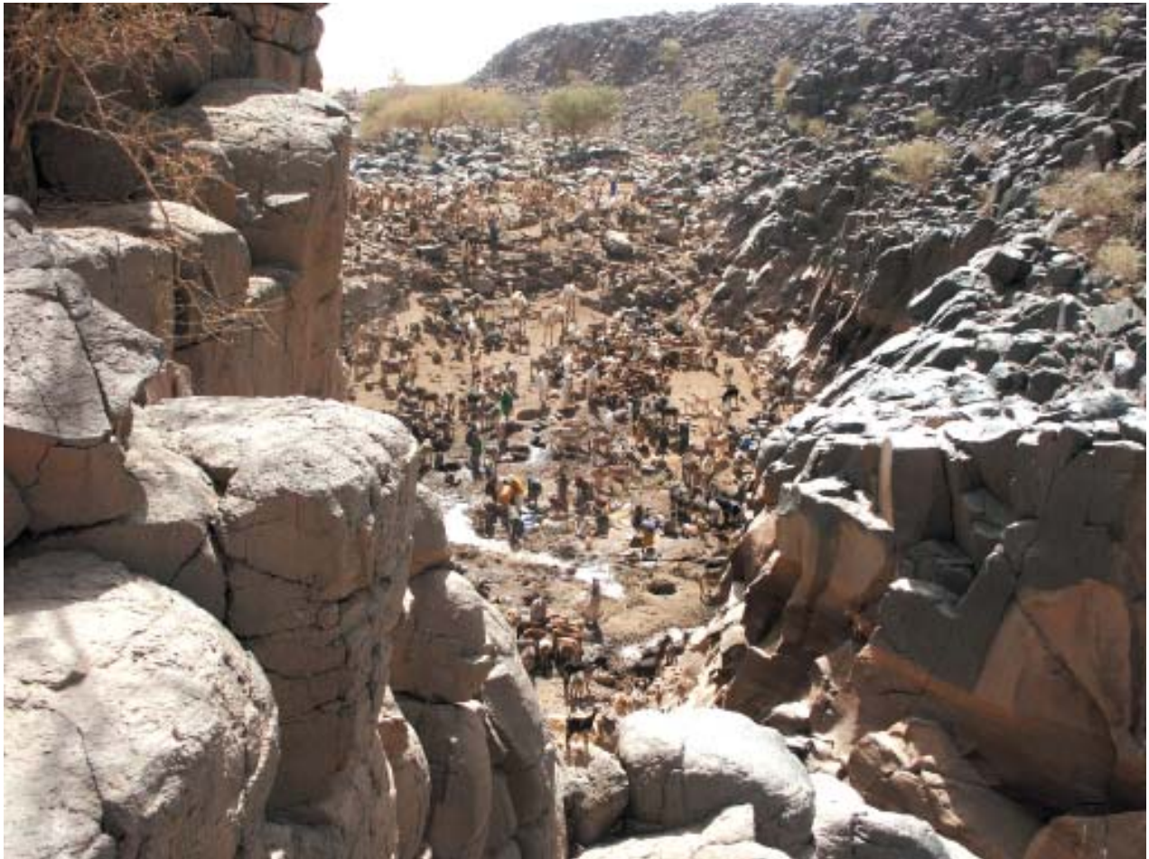
One of the biggest catastrophes in Africa in the 1970s, a drought turned the best cropland in five countries into cracked and barren earth. In fact, the term environmental refugees came into popular vocabulary after this. Many had to flee their homelands as agriculture was no longer possible.

agendas on the basis of vague scientific evidence and time frames. In that sense the discovery of the ozone hole over the Antarctic in the mid-1980s revealed the opportunity as well as dangers inherent in tackling global environmental problems.