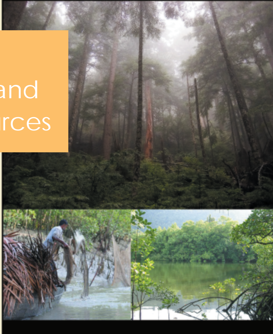
The 1992 Earth Summit has brought environmental issues to the centre-stage of global politics. The pictures above show rainforest and mangroves.

This chapter examines the growing significance of environmental as well as resource issues in world politics. It analyses in a comparative perspective some of the important environmental movements against the backdrop of the rising profile of environmentalism from the 1960s onwards. Notions of common property resources and the global commons too are assessed. We also discuss, in brief, the stand taken by India in more recent environmental debates. Next follows a brief account of the geopolitics of resource competition. We conclude by taking note of the indigenous peoples' voices and concerns from the margins of contemporary world politics.