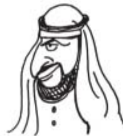
Sheikh Petrodollah King of the land of Black Gold

I value precious things. Bigoil says his President values freedom and democracy. So I keep both safely under lock and key in my land.