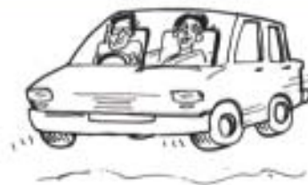
Mr & Mrs Gobbledoo

A new beauty is parked outside our garage. Awesome! Isn't it?...sleek chrome finish, power steering, automatic gears. Excellent pick up and great mileage too. It is low on emissions too...gentle on the atmosphere, you know. Global warming and all that stuff. Now we really are in hurry to zoom off and lead the good life...God Save Everyone!...vrrrooommmmm